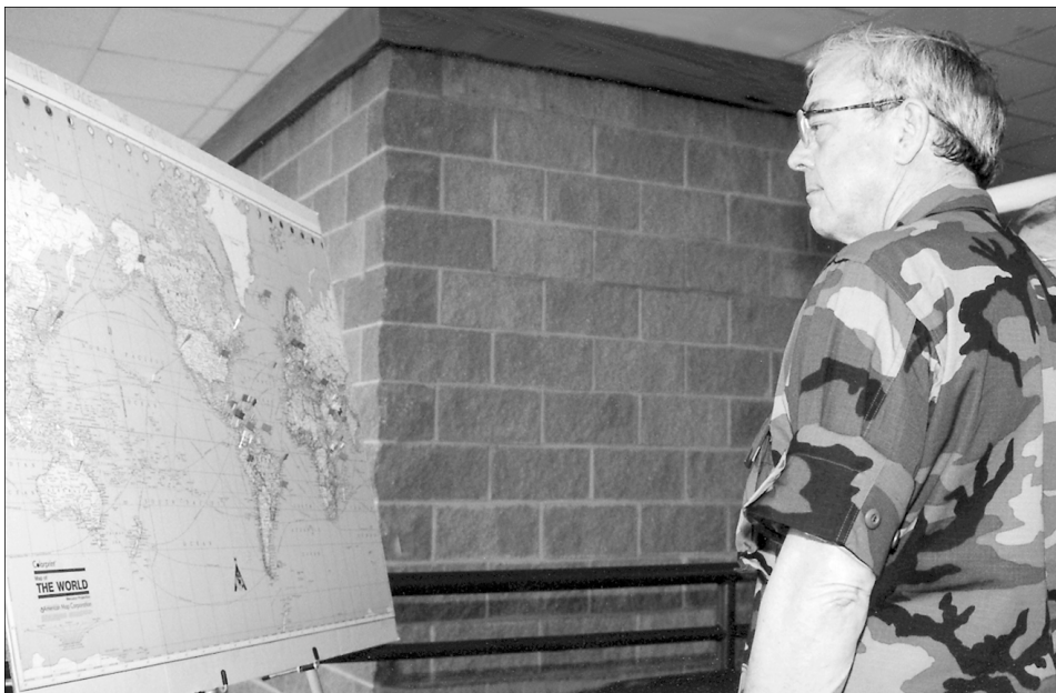
LEFT: Gov. Patton takes a moment to view the far-flung locations in which members of the Kentucky Air Guard have performed their global missions recently.